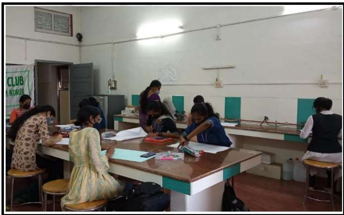
ENERGY AND ENVIRONMENT CONSERVATION CLUB