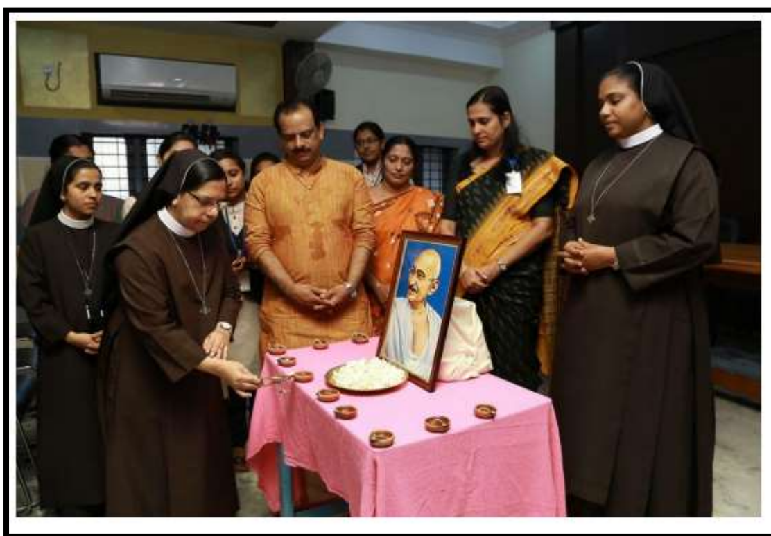
Human Rights Forum