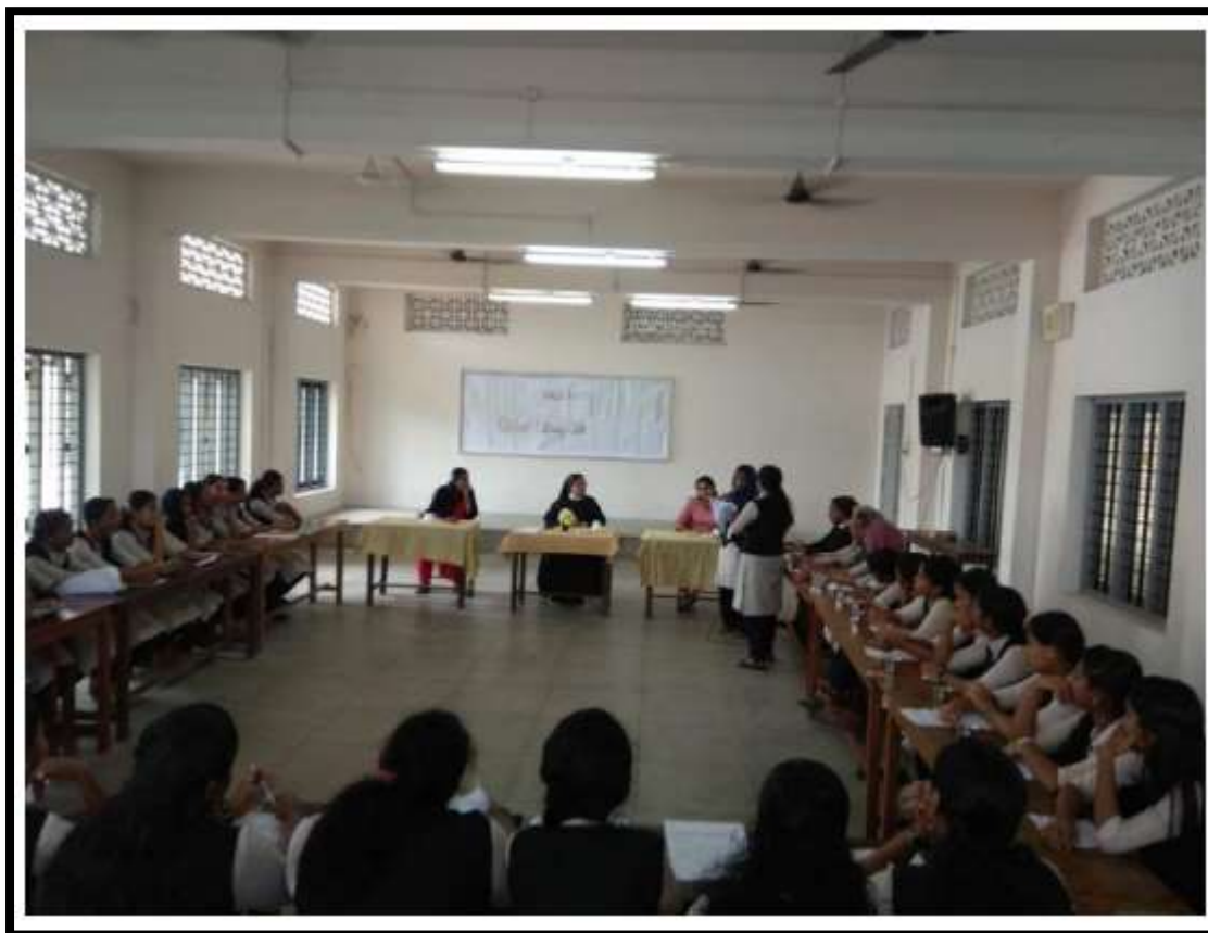
Legal Awareness and Gender Justice: BALLOT BRISTO- CHAI-PAY CHARCHA