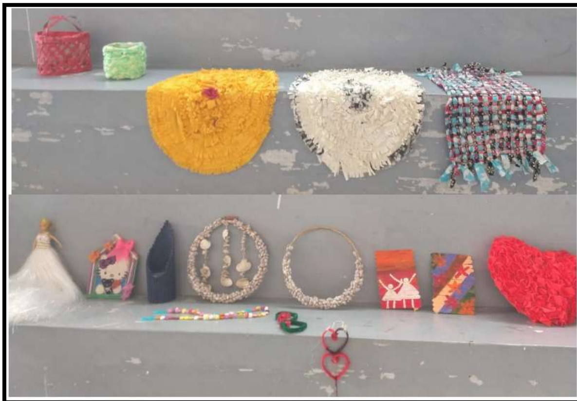
FINE ARTS CLUB