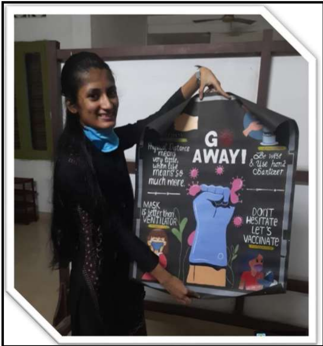
PAINTING AND PHOTOGRAPHY CLUB