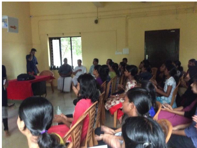
Class on Flood and Survival