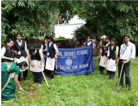
Environment Day on 5th June