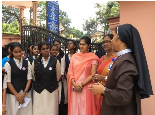
NSS unit was honoured by Anwar Memorial Palliative Care