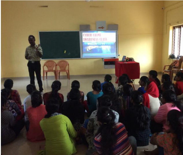
Awareness class on Cyber Crimes