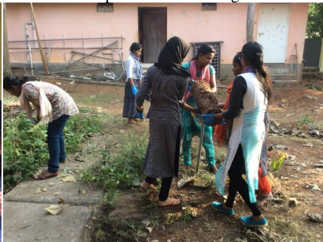
Camp Premises Cleaning