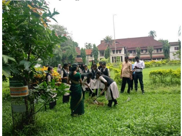
Planting of sapling