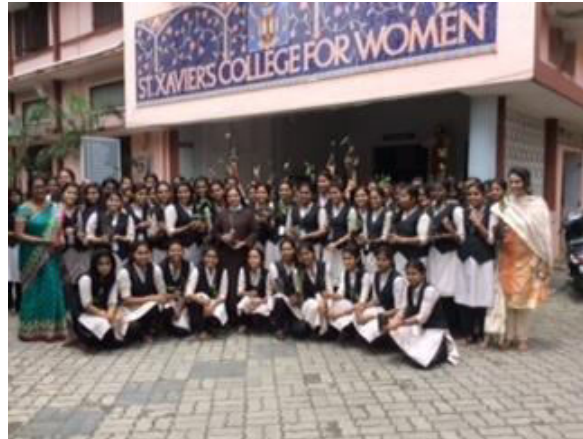
Jack fruit sapling planting Initiative