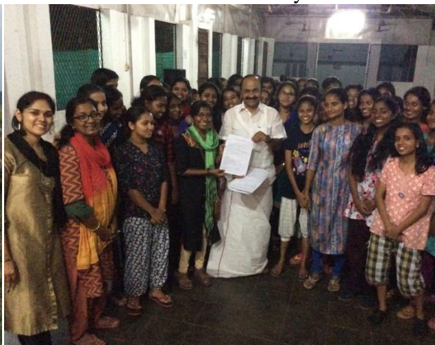
Evaluation Of survey