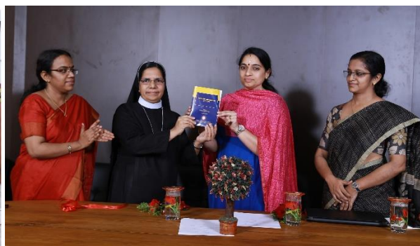
Release of Book of Abstracts 2017-18