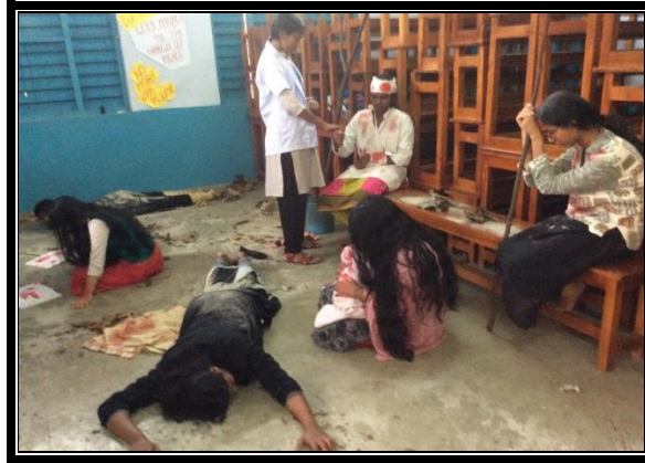
Installation by Peace Club Members