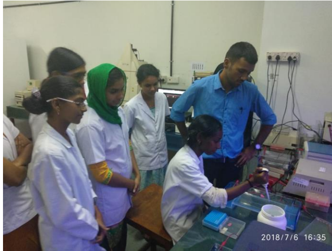
Training Session on Molecular Biology