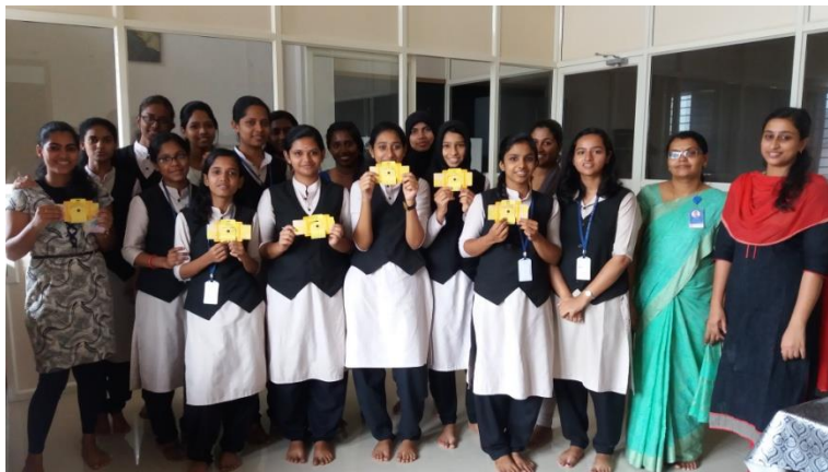
Workshop on Foldscope for BSc Zoology Students

Department organized a one-day workshop on “Foldscope as an Educational Tool” for nine schools in and around Aluva on 31.10.18. The objective of the workshop was to hone scientific temper of students and deliberate on how the foldscope can be used effectively as an educational tool. The workshop involved hands-on-training to school students and teachers in assembling and use of foldscope in observing various specimens. An orientation program on the use and assembling of foldscope was also conducted for the undergraduates of BSc. Zoology program on October 9th 2018.