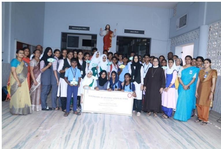
Participants of Workshop on Foldscope for School Students