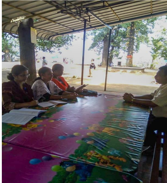
Post Flood Rapid Biodiversity Assessment Survey

loss due to floods. An assessment report was prepared highlighting the damage caused to the ecosystem during the recent floods. (22 nd to 26 th October, 2018). Report of the survey was handed over to Kerala Biodiversity Board.