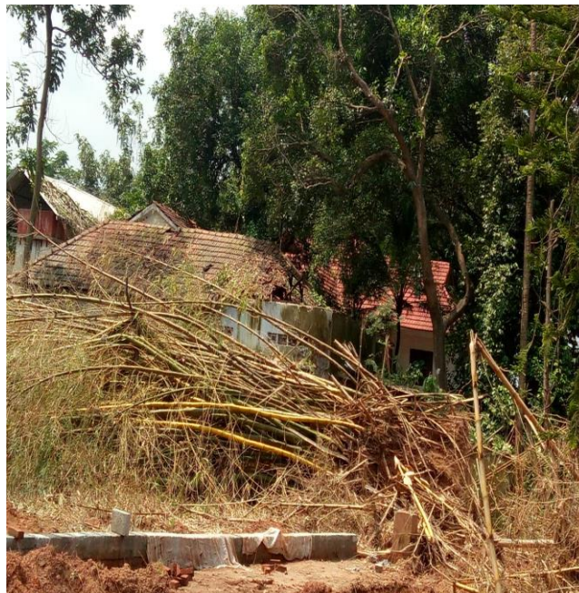
Post Flood Biodiversity Loss Assessment