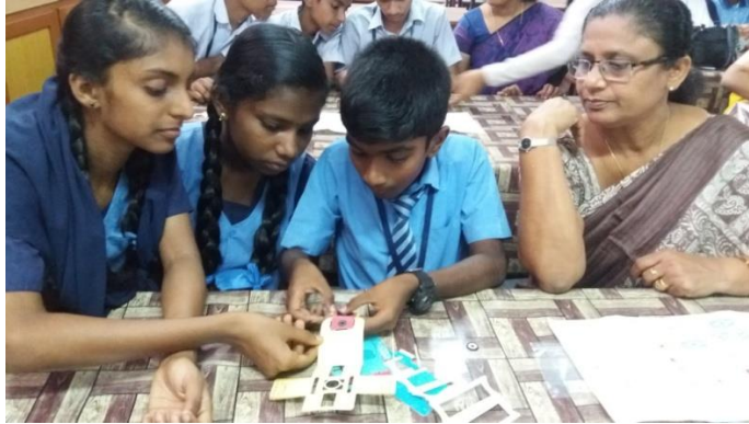
Workshop on Foldscope for School Students