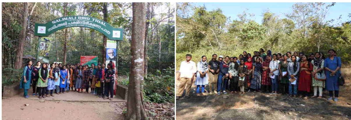
Nature Camp at Salim Ali Bird Sanctuary Thattekad

Final Year B.Sc. Zoology Model 1 – 34 students accompanied by two Teachers participated in the Nature camp at Salim Ali Bird sanctuary, Thattekad, funded by Kerala forests and Wildlife Department, Kerala from 09.01.19 to 11.01.19. Students documented birds of the habitat with the help of expert guidance and checklist of the bird data was uploaded to citizen science website.