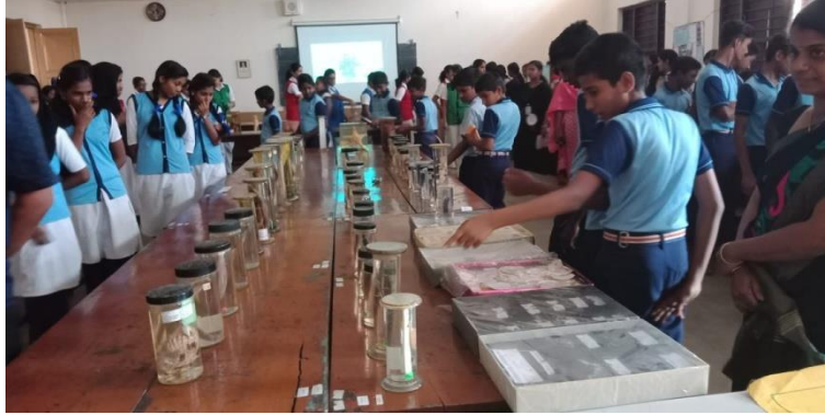
Xav- Exhibito wonders of animal world