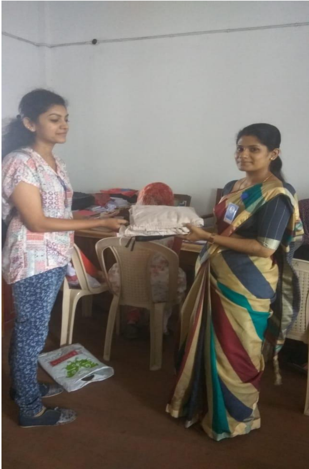
A helping hands from Alumni