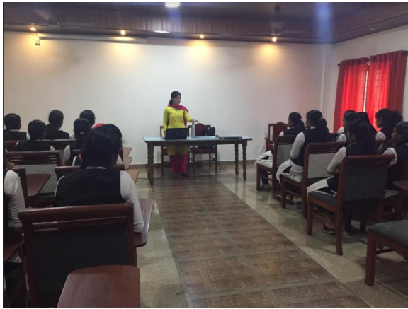
Alumni talk for the students of Computer Application