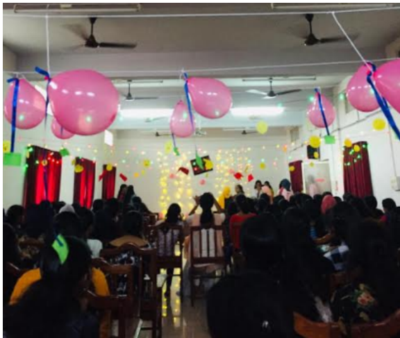
Freshers day celebration for first year Finance and Taxation students