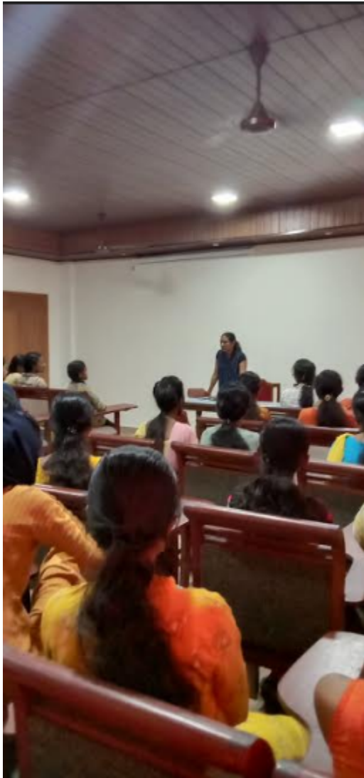
Alumni talk for the students of Travel and Tourism