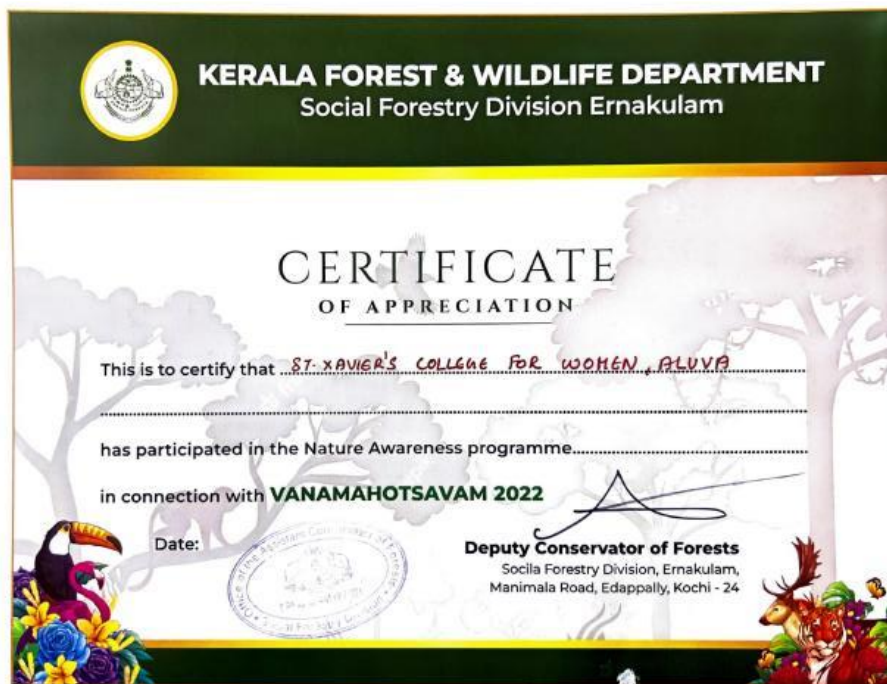
Figure 2 Vanamahotsavam Participation Certificate (Awareness Programme)