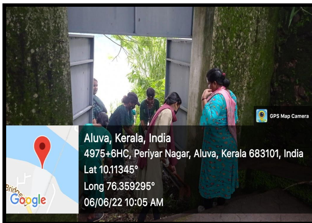
Figure 1 Cleaning of the ghat of river Periyar ( Shivrathri Manappuram)