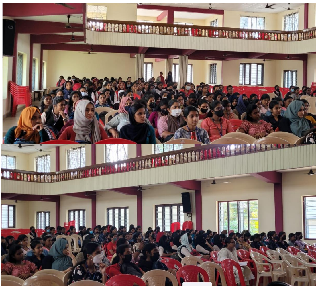
Figure 1 Oracle 2022-23: 18/01/2023